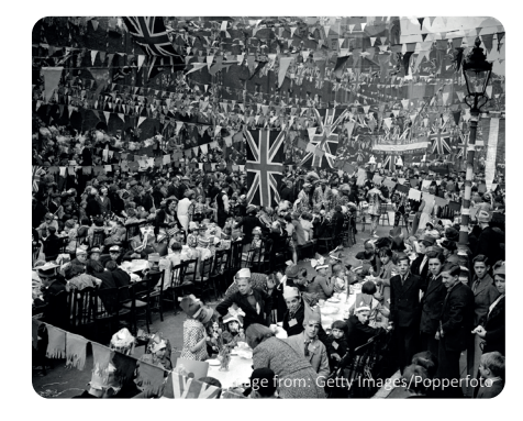
Street party to celebrate the coronation.