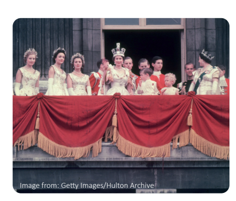
Queen Elizabeth II on her coronation.

A coronation is a ceremony where the crown is placed on the head of the new king or queen. Elizabeth II was the Queen of the United Kingdom for 70 years until she died in 2022. The coronation ceremony of Elizabeth II took place on 2nd June 1953 at Westminster Abbey, London. Many people celebrated the coronation by holding street parties.