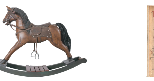
wooden rocking horse