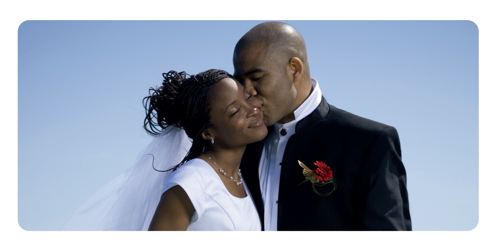
Weddings happen when two adults get married.