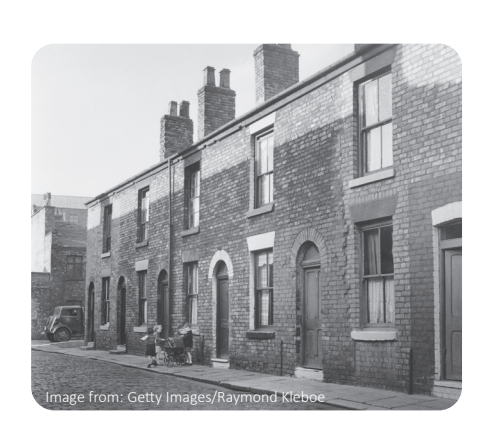
A street in the 1950s.

The way people use land changes over time. For example, in the 1950s there were fewer cars, so fewer roads were needed. Today lots of people have cars, so there are many more roads for people to drive on and driveways for parking.