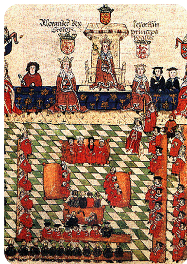
Edward I and the Model Parliament

The power of the monarchy has changed over time. In the past, some monarchs had absolute power. This meant that they could do whatever they wanted. Today, there is a constitutional monarchy. This means that the monarch is controlled by parliament and the government.