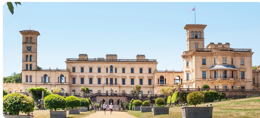
Osborne House is on the Isle of Wight, England.