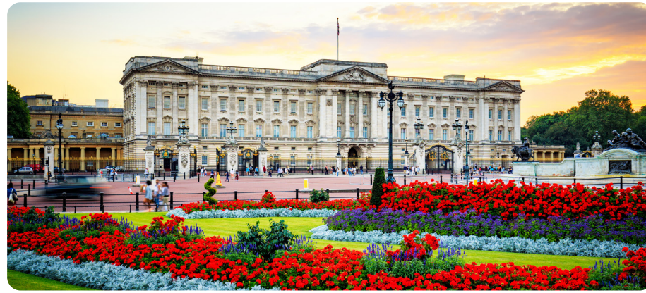
Buckingham Palace is in London, England.

Royal residences include palaces, castles and stately homes. Some of them are used for official royal business. Some are used as holiday or private homes. Many are tourist attractions.